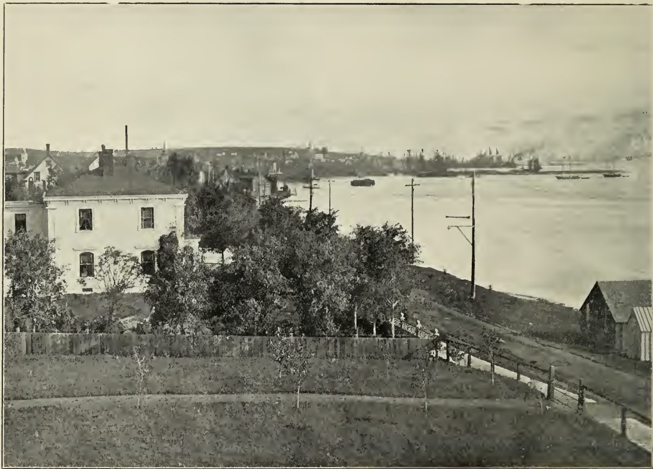
NORTH SYDNEY AND HARBOR, C.B.